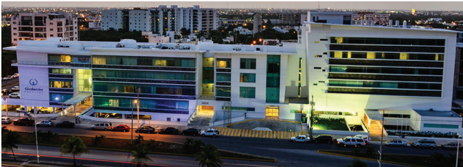
Galenia Hospital, Cancun, Mexico Triple Accredited