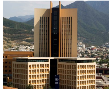
Hospital Zambrano Hellion Tec Salud, Monterrey, Mexico Joint Commission Accreditation Due 2024